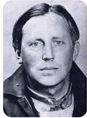
Nordahl Grieg 1902 – 1943 Norwegian Poet, Novelist, Patriot

Nordahl's Tidende is published on the 1 st of each month. Deadline to submit information for the next issue is the 15 th of each month. Please send all submissions via email to editor@nordahl-grieg.org . Advertise in the Tidende – information and rates are available at www.nordahl-grieg.org . Business meetings are generally held on the 3 rd Thursday of the month and announced in the Tidende. Social events are announced in the Tidende and via email.