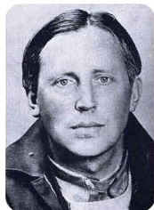
Nordahl Grieg 1902 – 1943 Norwegian Poet, Novelist, Patriot

Nordahl's Tidende is published on the 1 st of each month. Deadline to submit information for the next issue is the 15 th of each month. Please send all submissions via email to editor@nordahl-grieg.org . Advertise in the Tidende – information and rates are available at www.nordahl-grieg.org . Business meetings are generally held on the 3 rd Thursday of the month and announced in the Tidende. Social events are announced in the Tidende and via email.