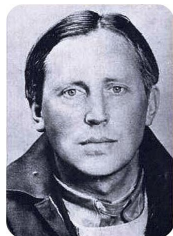
Nordahl Grieg 1902 – 1943 Norwegian Poet, Novelist, Patriot

Nordahl's Tidende is published on the 1 st of each month.