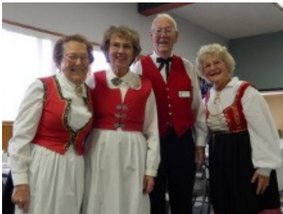
Dining Room Helpers at the Lutefisk Dinner