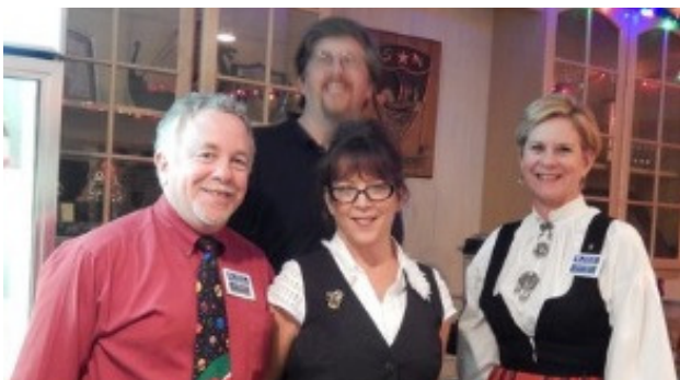
The intrepid bar crew from the Lutefisk Dinner.