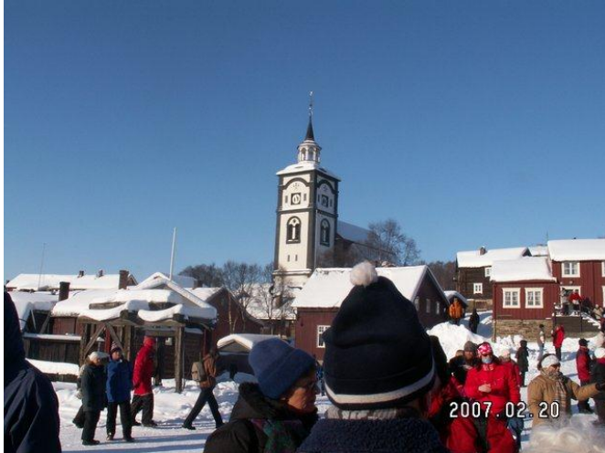
Cathedral in Røros during Winter Market Festival

One of the great attractions in Røros is the Cathedral. It is the second largest Cathedral in Norway, after Nidaros Cathedral in Trondheim. In the evenings there are dances in town, and usually a concert one night in the Cathedral. In 2007 we attended what was only the second performance of a concert of “Vindens hjul Gammeldnasmesse” which was composed and conducted by Henning Sommerro. The music is based on traditional dance music, and the songs are the Latin mass from the Norwegian Lutheran church.