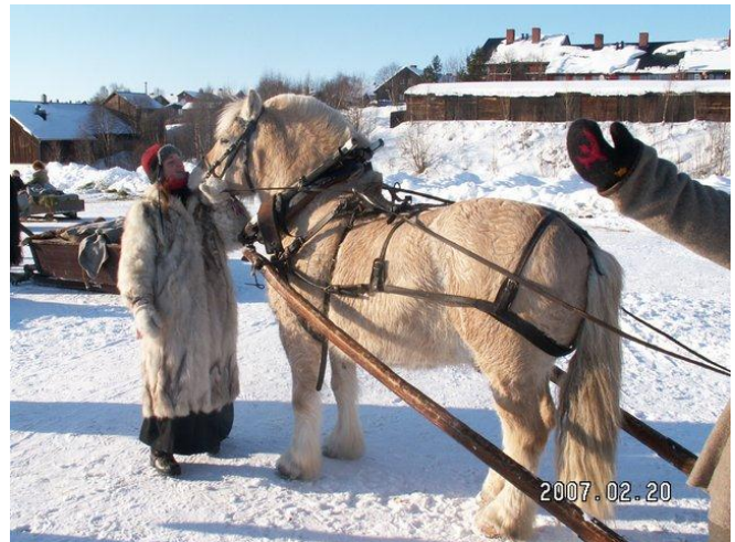
Norwegian Fjord Horse at Røros Market Festival

In February, 2007, Meg and I traveled to Røros, Norway for the winter market festival. The festival began in 1863 as a winter market day for the isolated mountain town of Røros so that foodstuffs could be brought in for the copper miners. Today it is a market for traditional arts and crafts that are brought by artisans and craftsmen who arrive on horse-drawn sleds. Some of them travel for as much as 14 days from their home town in Norway or Sweden. They stay at farms each night, so that their horses can be sheltered in a barn.